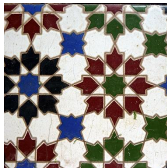
Arabic, Persian and Turkish Pages 17-18