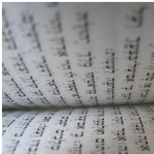
Hebrew, Jewish and Eastern Christian Studies Pages 8-10