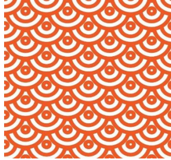
Japanese and Korean Pages 14-15