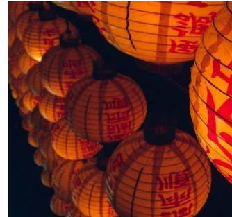
Chinese Studies Page 16